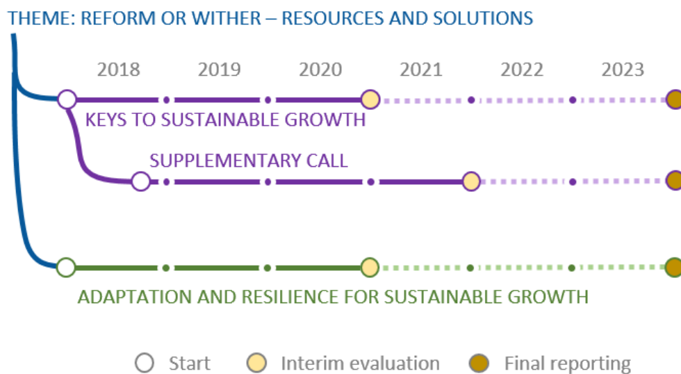
Figure 2. The SRC has launched two programmes under the strategic research theme Reform or Wither – Resources and Solutions: Keys to Sustainable Growth and Adaptation and Resilience for Sustainable Growth. The present call will supplement the programme Keys to Sustainable Growth. The broken lines indicate the second funding period. The funding for the second period is applied for separately and decided based on an interim evaluation (see 3.5).