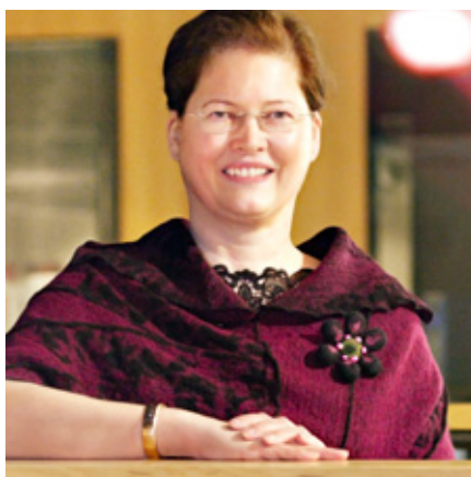
Professor Taina Pihlajaniemi

“We want to facilitate the detection of cancer and treatment before the disease progresses too far”