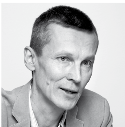
Professor Jukka Pekola

More specifically, research at our CoE includes charge and heat transfer and related fluctuations, and mechanical motion governed by quantum mechanics. The materials we study include helium superfluids, superconductors, graphene and carbon nanotubes as well as ordinary metals.