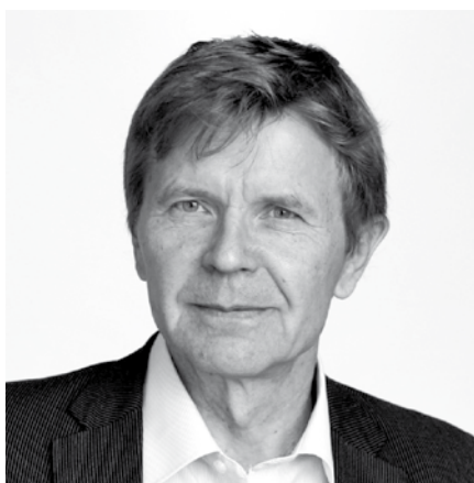
Professor Rauno Julin

We have now been granted CoE status for a third time, a great achievement that has required us to reinvent ourselves time and again. We have shown that it is indeed possible in Finland to develop a major research infrastructure for experimental and theoretical research that is operated in conjunction with a university. We also provide diverse training in this field.